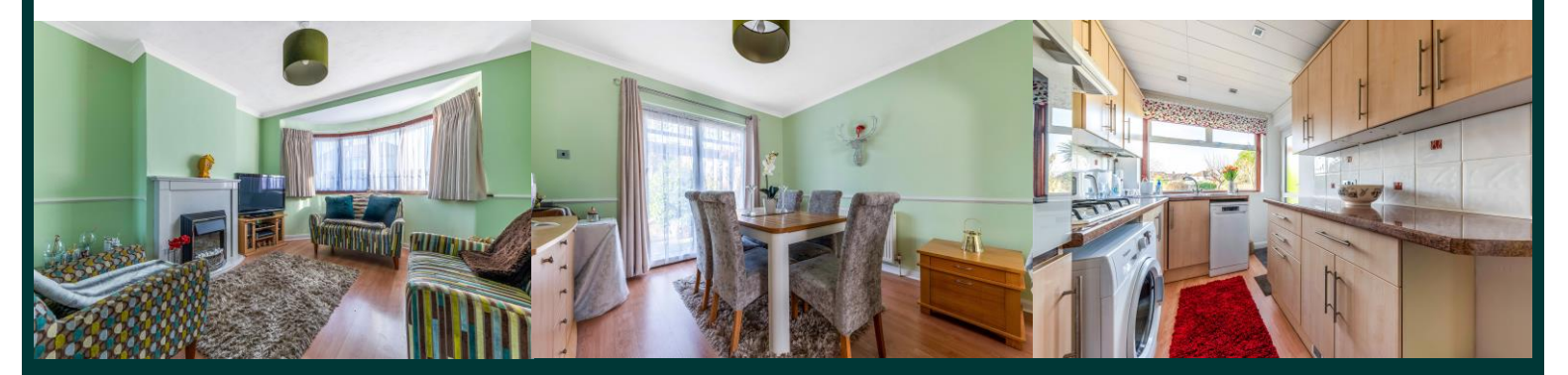
16 Goodwin Drive Sidcup, DA14 4PA